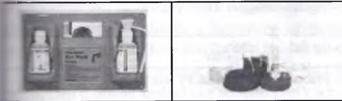
a) Laboratory equipment b) Psychology laboratory

1 Look at the pictures and match them and their definitions.