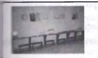
e) A workbench in chemistry laboratory

2 Look at the pictures above and write how important they are.