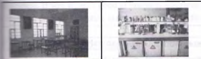
c) Laboratory safety d) Science laboratory